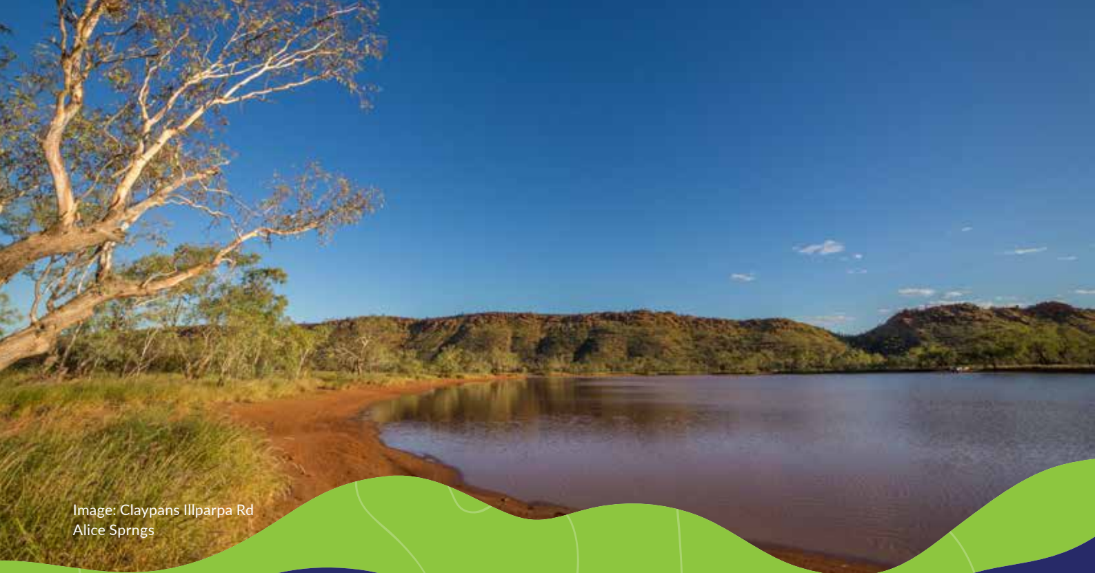
Image: Claypans Illparpa Rd Alice Springs