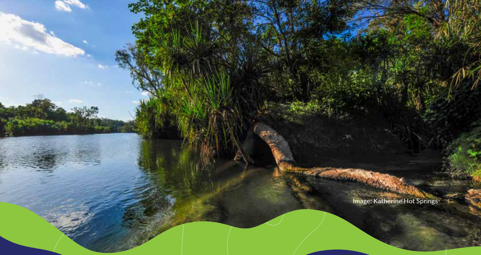
Image: Katherine Hot Springs